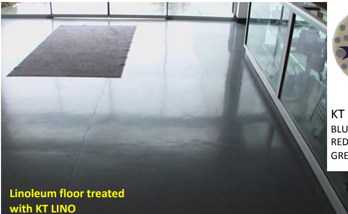
Linoleum floor treated with KT LINO

The excellent results and the high life-time of these new tools (that can change according to the starting condition of the floor) will surely make these new accessories of Künzle & Tasin a must-have from part of all the professionals in the stone, the concrete and the cleaning market.