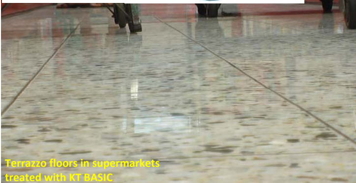
Terrazzo floors in supermarkets treated with KT BASIC