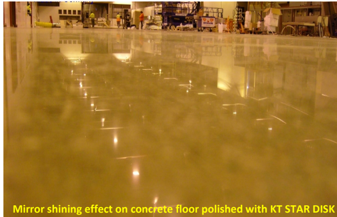
Mirror shining effect on concrete floor polished with KT STAR DISK

For the end users, the consequences of an eventual improper attitude from part of the professionals during the