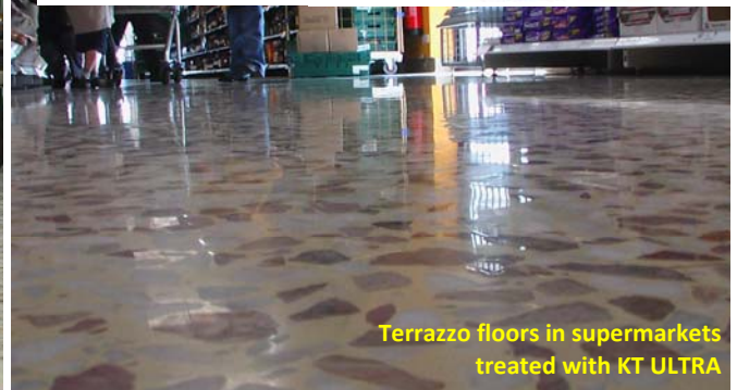
Terrazzo floors in supermarkets treated with KT ULTRA